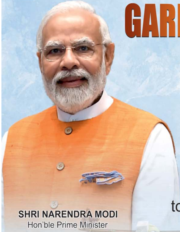
SHRI NARENDRA MODI Hon'ble Prime Minister