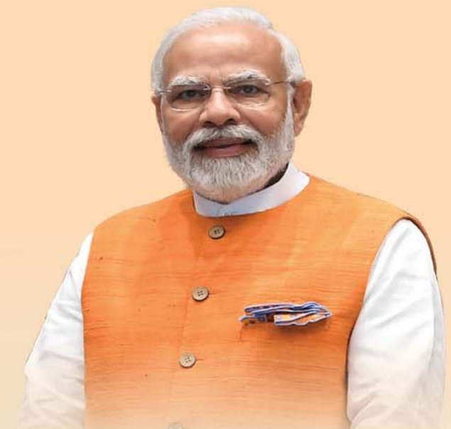
Narendra Modi Prime Minister

Quality Generic Medicines at Affordable Prices