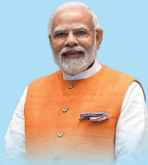
Narendra Modi Prime Minister