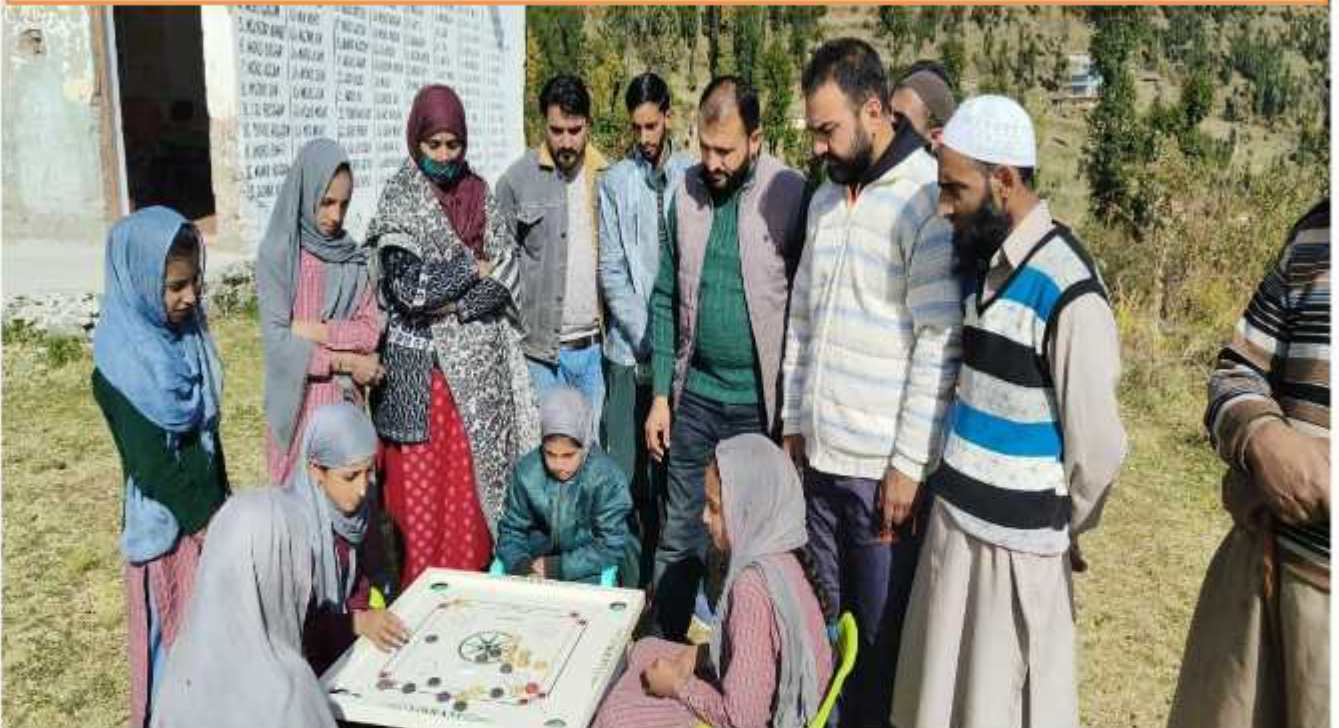
Checking Learning Outcomes at HS Murrah Kulali