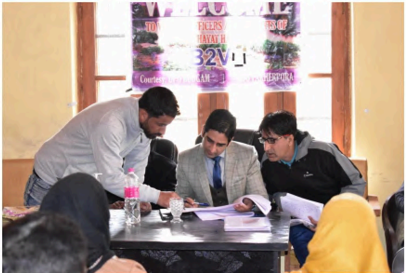
Office of the Panchayat