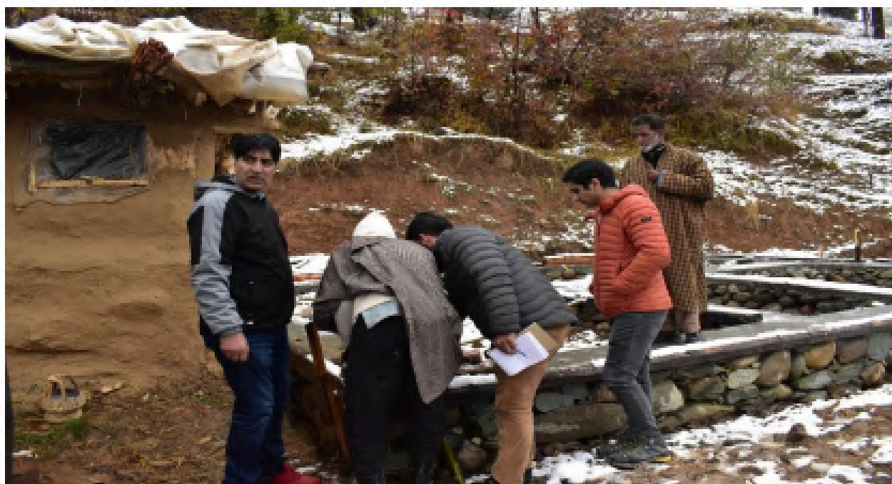
Inauguration of PMAY House