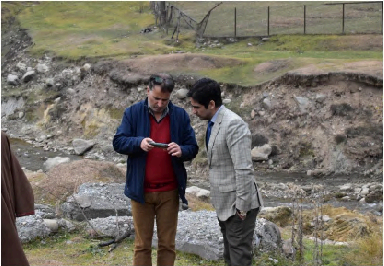
Site Visit with Engineers