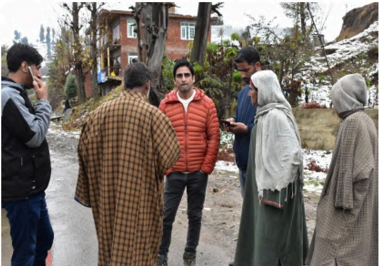
Addressal of issues