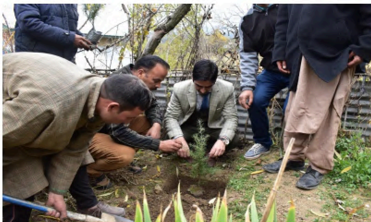
Plantation Drive for Green and Clean Village