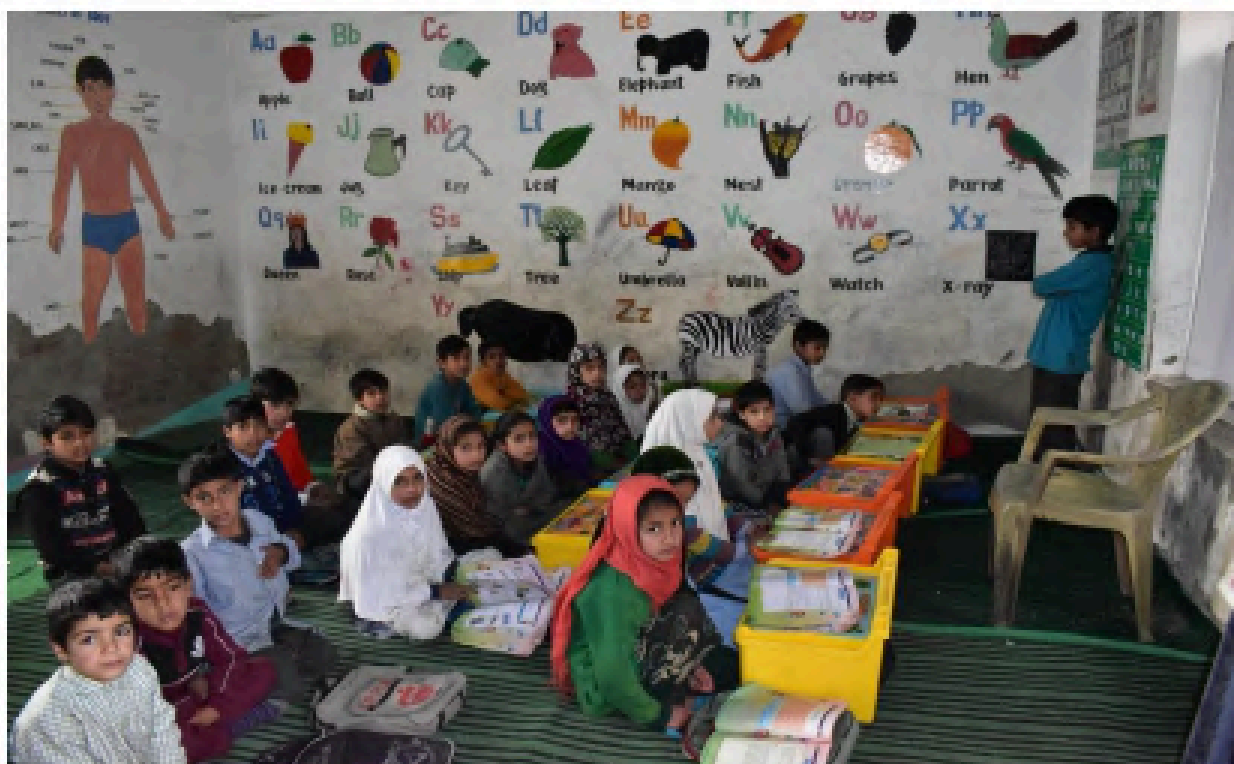
Primary School in Nagbal