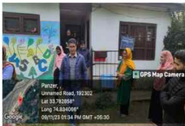
VISIT OF ANGANWARI CENTER