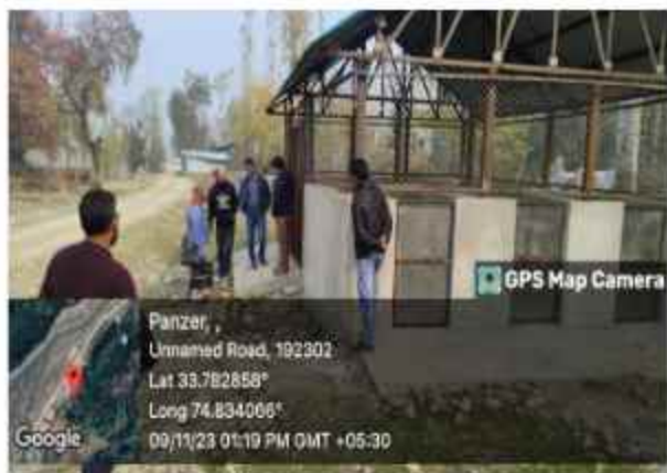
VISIT OF SEGREGATION SHED