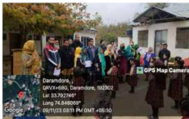
DISTRIBUTION OF CERTIFICATES