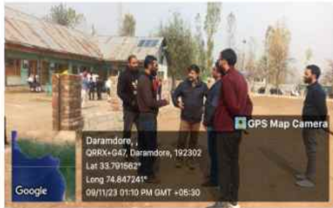
VISIT OF PLAYGROUND, CONSTRUCTED UNDER ABDP SCHEME