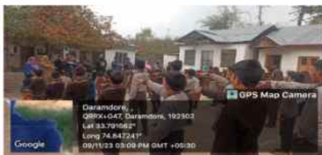
PLEDGE – NASHA MUKT BHARAT