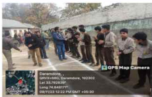
INTERACTION WITH SCHOOL CHILDRENS