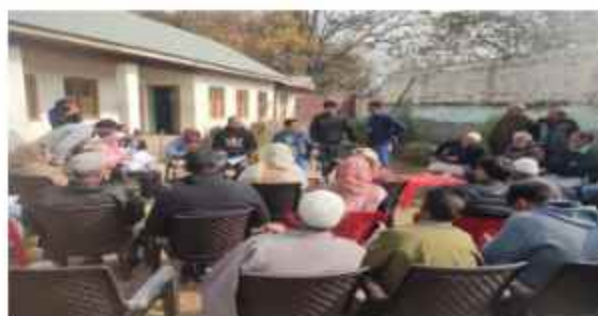
DEMANDS AND GRIEVANCES REDRESSAL