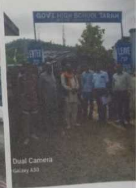
Dual Camera Galaxy A30