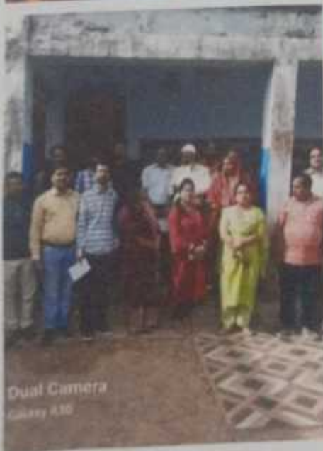
Dual Camera Galaxy A30