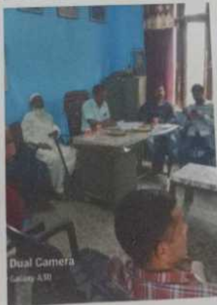
Dual Camera Galaxy A30