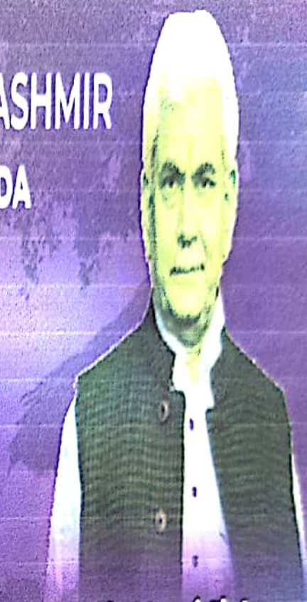
Sh. Manoj Sinha Hon'ble Lieutenant Governor Jammu & Kashmir