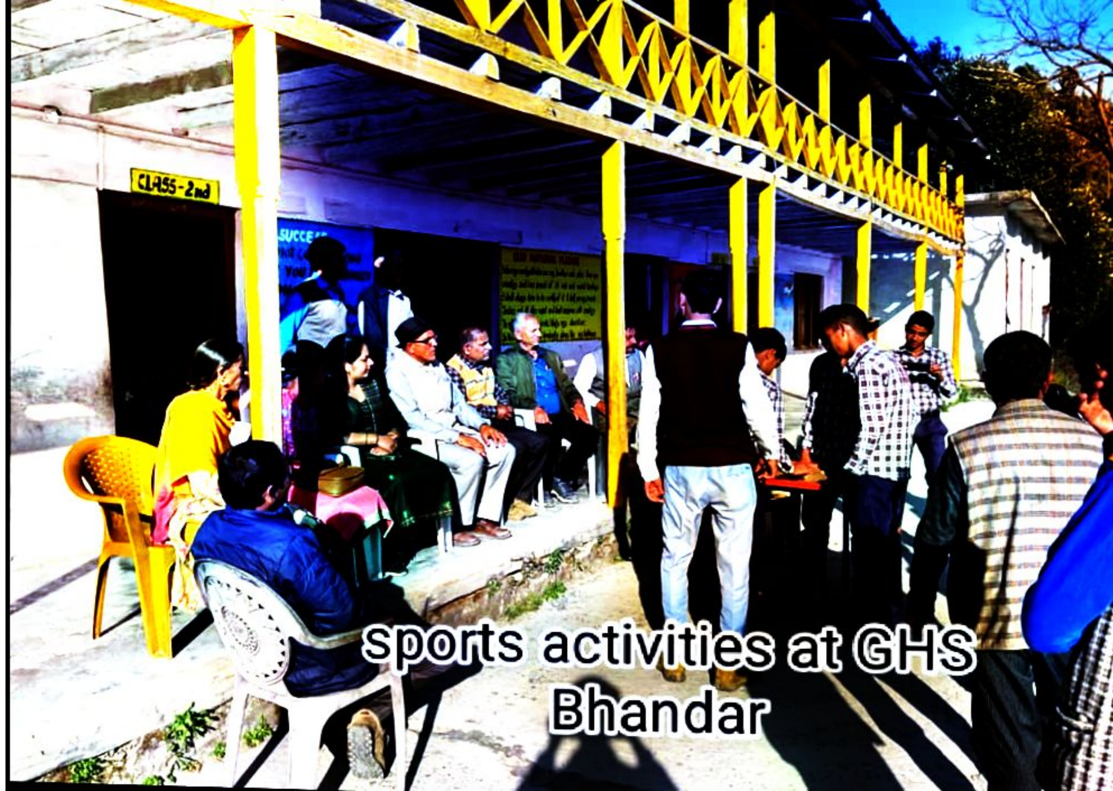
sports activities at GHS Bhandar