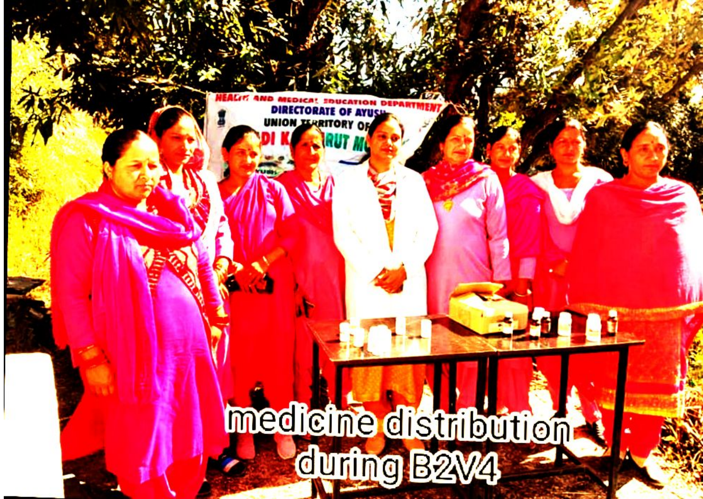
medicine distribution during B2V4