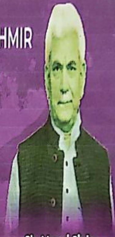
Sh. Manoj Sinha

GOVERNMENT OF JAMMU & KASHMIR DISTRICT ADMINISTRATION, DODA