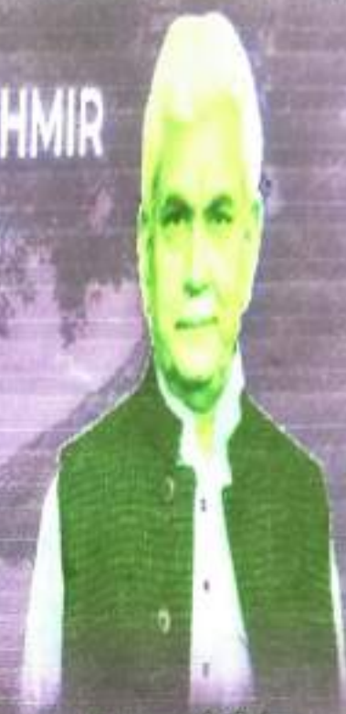
Sh. Manoj Sinha

GOVERNMENT OF JAMMU & KASHMIR DISTRICT ADMINISTRATION, DODA