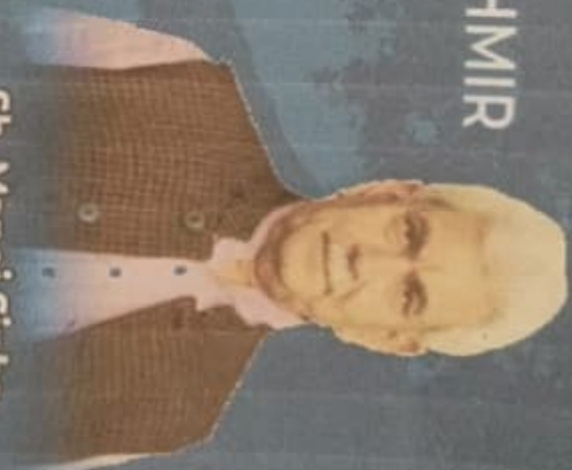
Sh. Manoj Sinha Hon'ble Lieutenant Governor Jammu & Kashmir