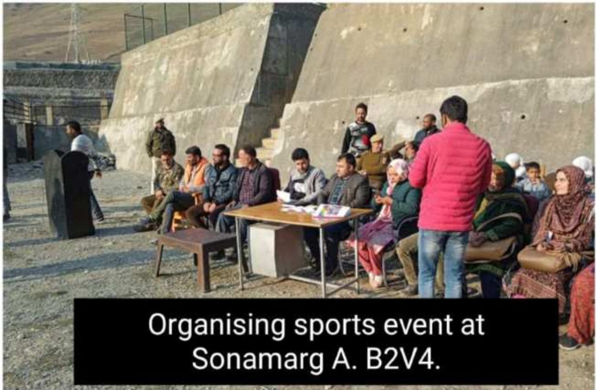
Organising sports event at Sonamarg A. B2V4.