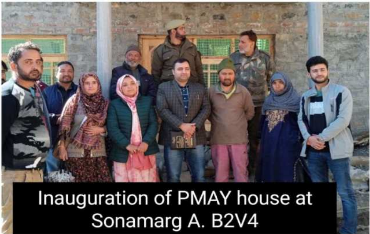
Inauguration of PMAY house at Sonamarg A. B2V4