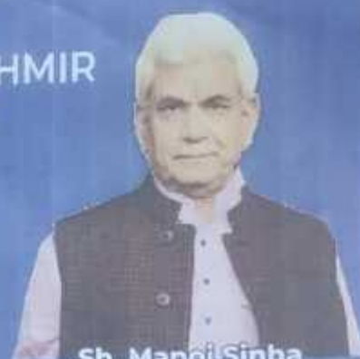
Sh. Manoj Sinha Hon'ble Lieutenant Governor Jammu & Kashmir

GOVERNMENT OF JAMMU & KASHMIR DISTRICT ADMINISTRATION, DODA