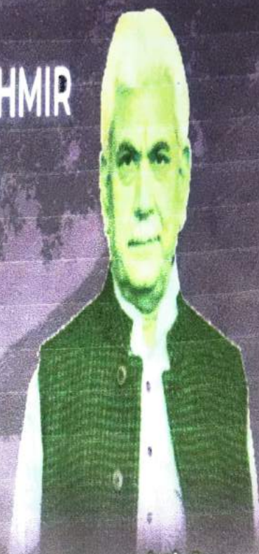
Sh. Manoj Sinha Hon'ble Lieutenant Governor Jammu & Kashmir