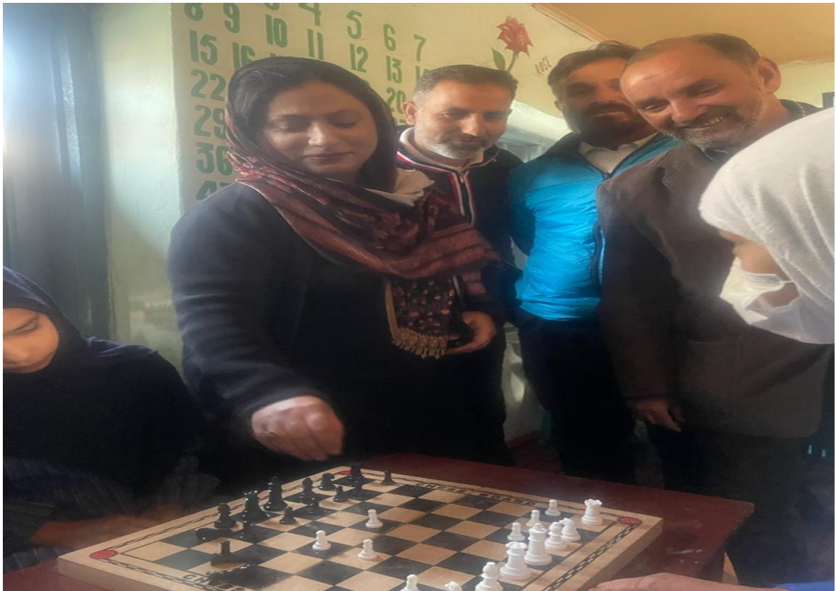
Panchayat Ghar Kremshore