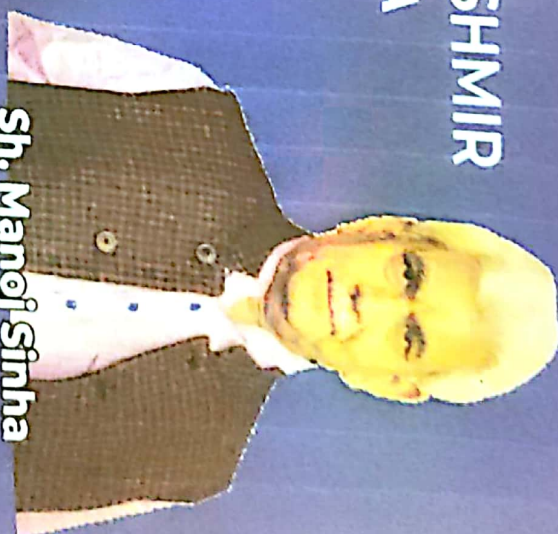
Sh. Manoj Sinha Hon'ble Lieutenant Governor Jammu & Kashmir