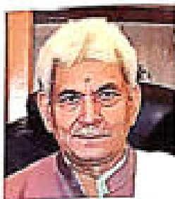
LIEUTENANT GOVERNOR JAMMU & KASHMIR