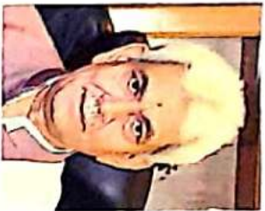
LIEUTENANT GOVERNOR JAMMU & KASHMIR