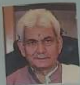
LIEUTENANT GOVERNOR JAMMU & KASHMIR