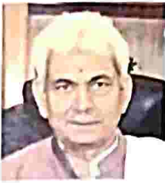
LIEUTENANT GOVERNOR JAMMU & KASHMIR