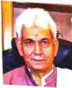
LIEUTENANT GOVERNOR JAMMU & KASHMIR