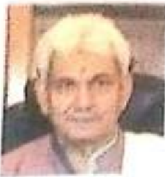
LIEUTENANT GOVERNOR JAMMU & KASHMIR