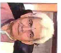
LIEUTENANT GOVERNOR JAMMU & KASHMIR