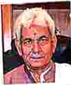
LIEUTENANT GOVERNOR JAMMU & KASHMIR