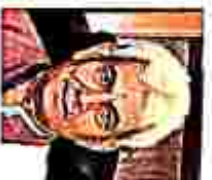
LIEUTENANT GOVERNOR JAMMU & KASHMIR