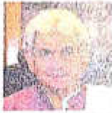
LIEUTENANT GOVERNOR JAMMU & KASHMIR