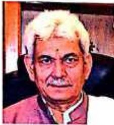
LIEUTENANT GOVERNOR JAMMU & KASHMIR