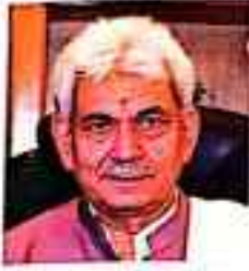
LIEUTENANT GOVERNOR JAMMU & KASHMIR