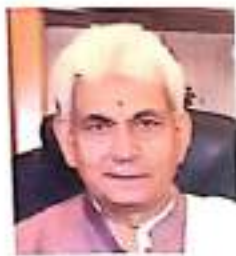
LIEUTENANT GOVERNOR JAMMU & KASHMIR