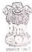
RAJ BHAWAN SRINAGAR