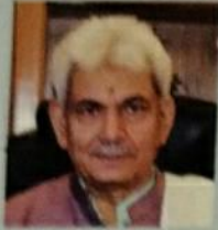
LIEUTENANT GOVERNOR JAMMU & KASHMIR