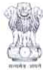
RAJ BHAWAN SRINAGAR