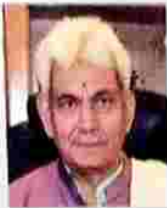
LIEUTENANT GOVERNOR JAMMU & KASHMIR