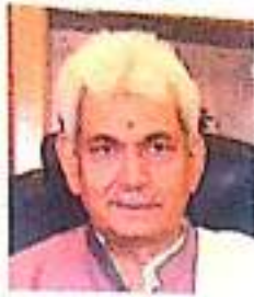
LIEUTENANT GOVERNOR JAMMU & KASHMIR