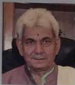
LIEUTENANT GOVERNOR JAMMU & KASHMIR