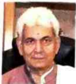
LIEUTENANT GOVERNOR JAMMU & KASHMIR